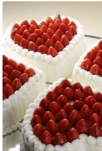
Valentine cake in Hilton