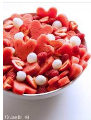
A Designer Life .NET

How to Make Strawberry Roses Gepind vanaf spendwithpennies.com