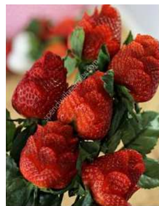
van Spend With Pennies

7 Restaurants Rolling Out Valentine's Day Treats