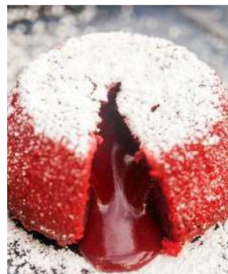
Gepind vanaf spachethespatula.com