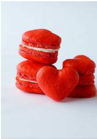
Valentine's Day DIY - red velvet heart macarons