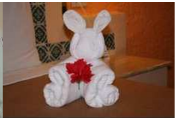
Valentine's Day towel hospitality