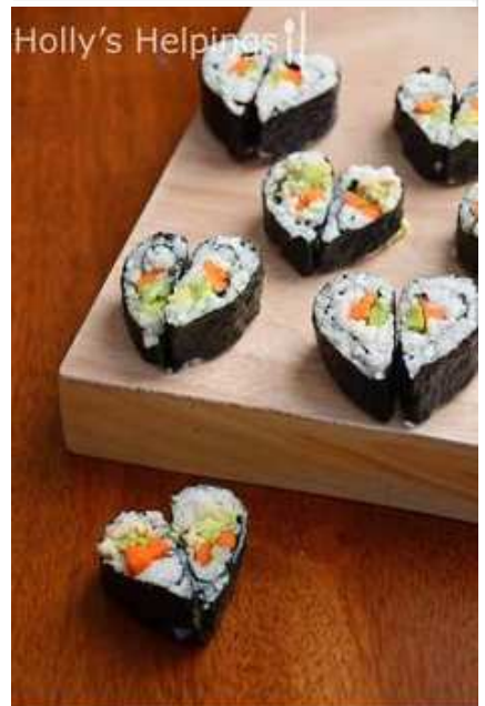
I love you! Heart-shaped Sushi. Perfect for a Valentines Day dinner with your honey :) @Mikayla Skidmore :P