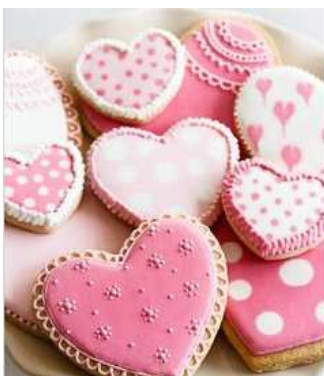
Gepind vanaf seededatthetable.com