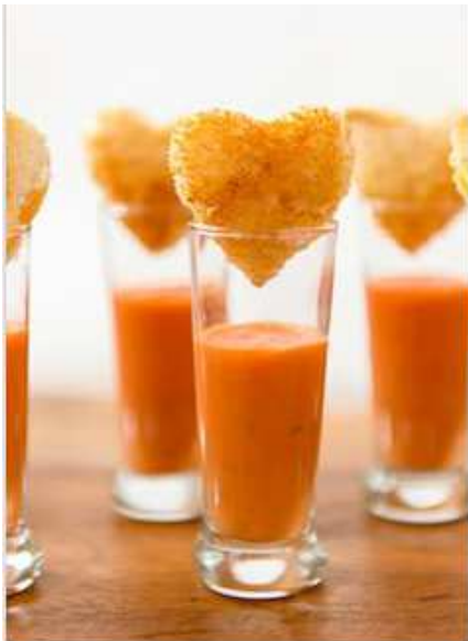
heart-shaped grilled cheese! Fresh. Local. Good. Food Group