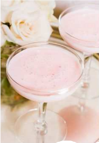
Charleston Pink Recipe - looks perfect for Val