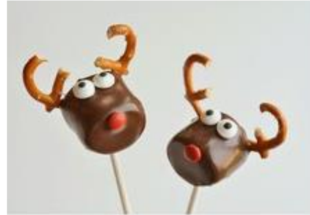
marshmallow REINDEER TREATS

Carolers seem a bit over the top for our party, but a great idea to use together with colleagues within the hospitality industry: from terrace to terrace! Take a look through our inspiration and who knows... you might come across something that you can also use in your hospitality business.